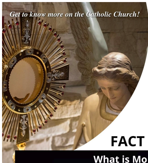
Get to know more on the Catholic Church!

Also, remember that our parish would not have these activities if it were not for people who generously give of their time and talent. Please make sure to take the time to thank these people.